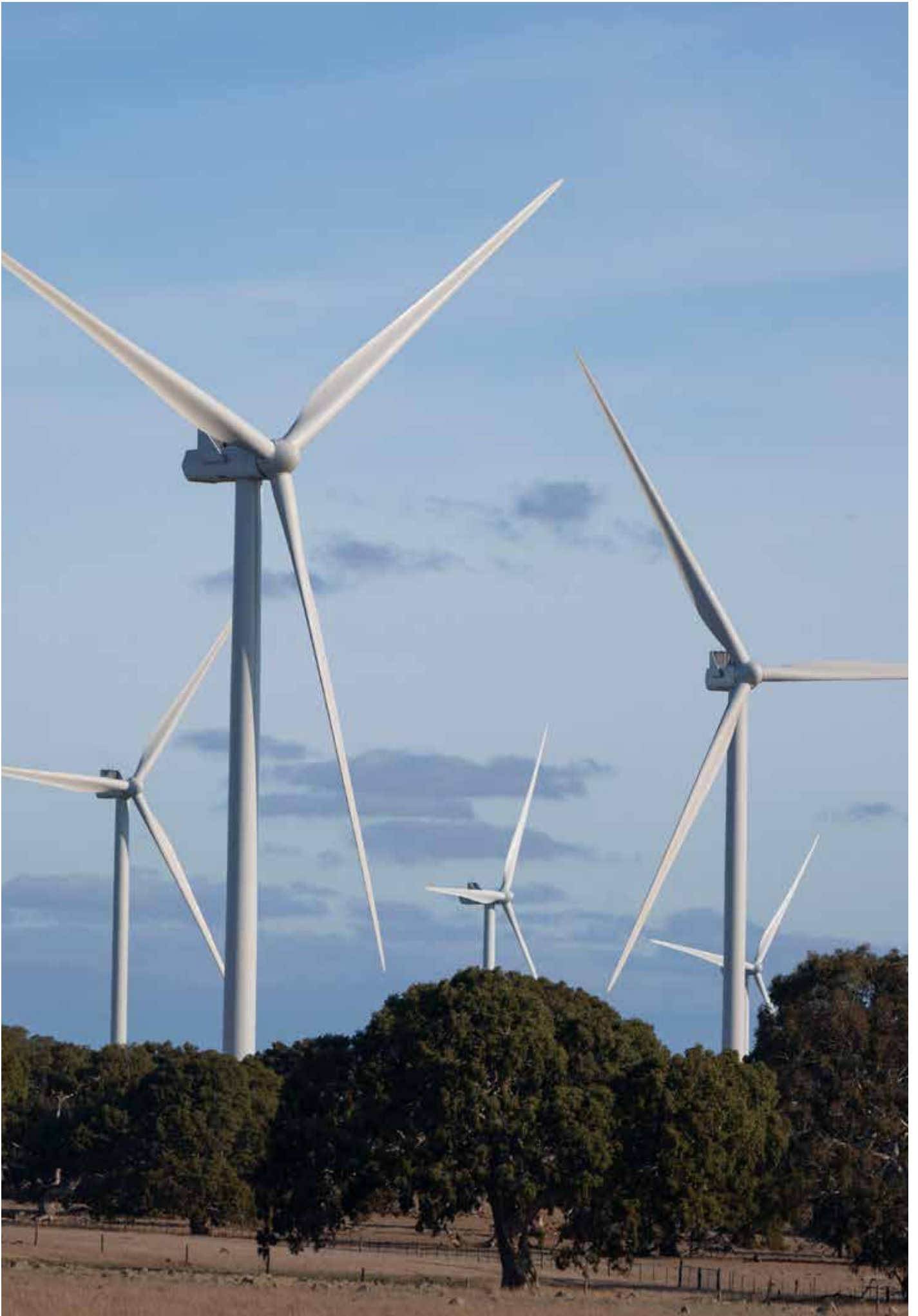
Salt Creek wind farm