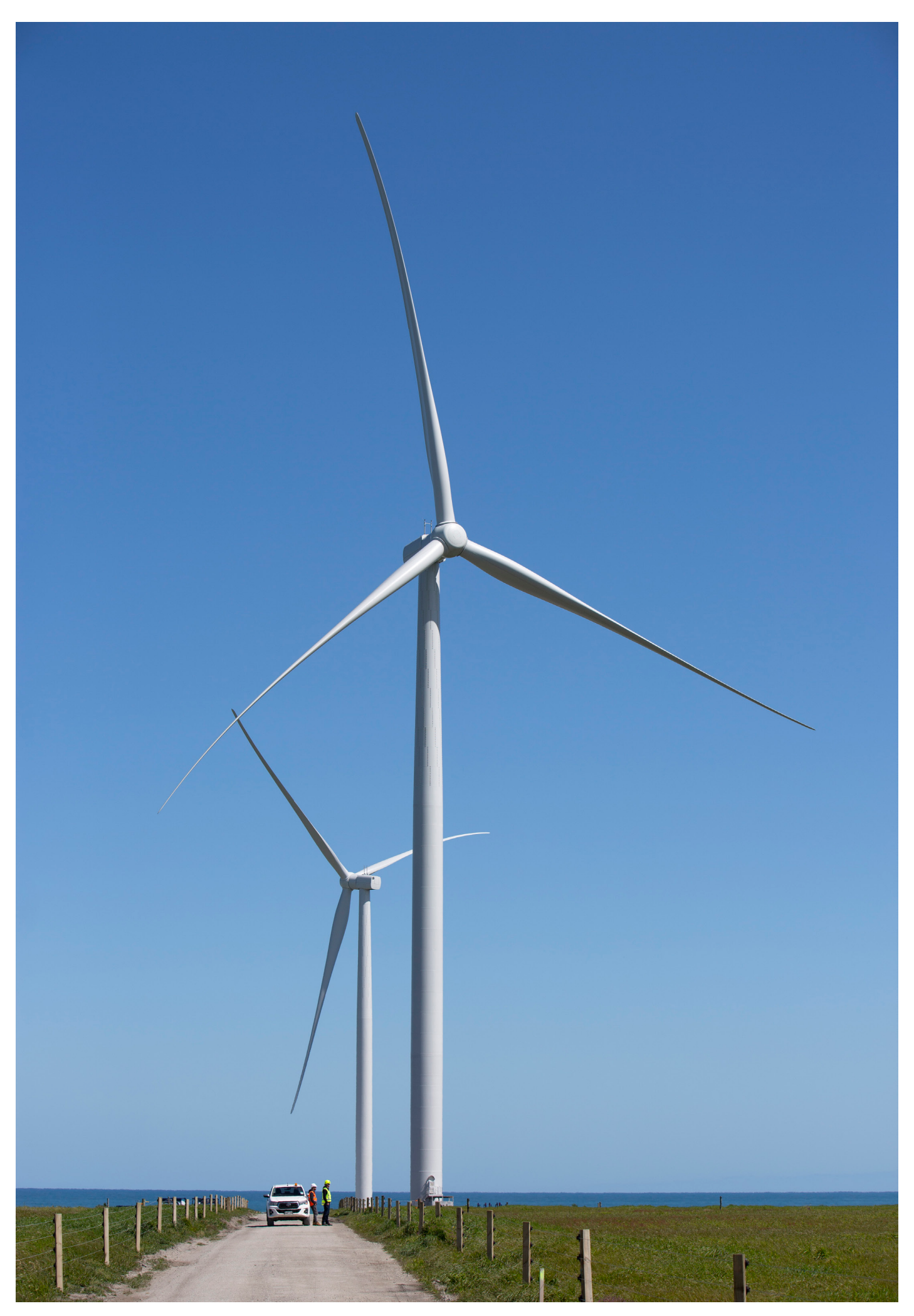
Tilt Renewables' Waipipi wind farm, Taranaki