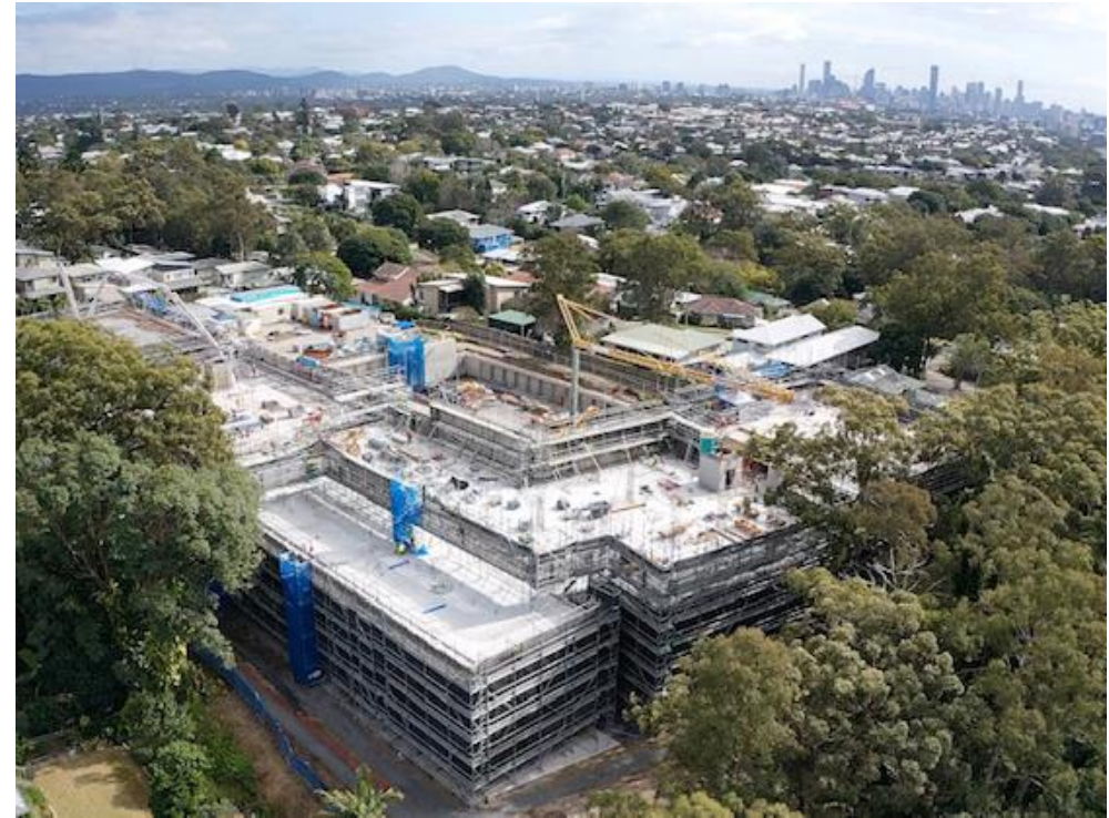
The Green in Tarragindi, Brisbane