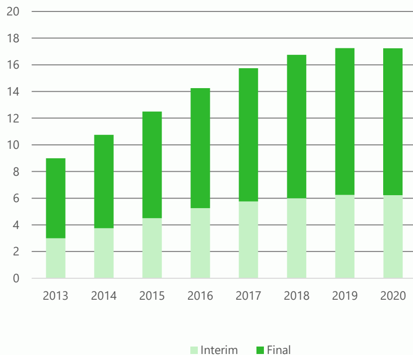
Ordinary Dividend per Share Profile