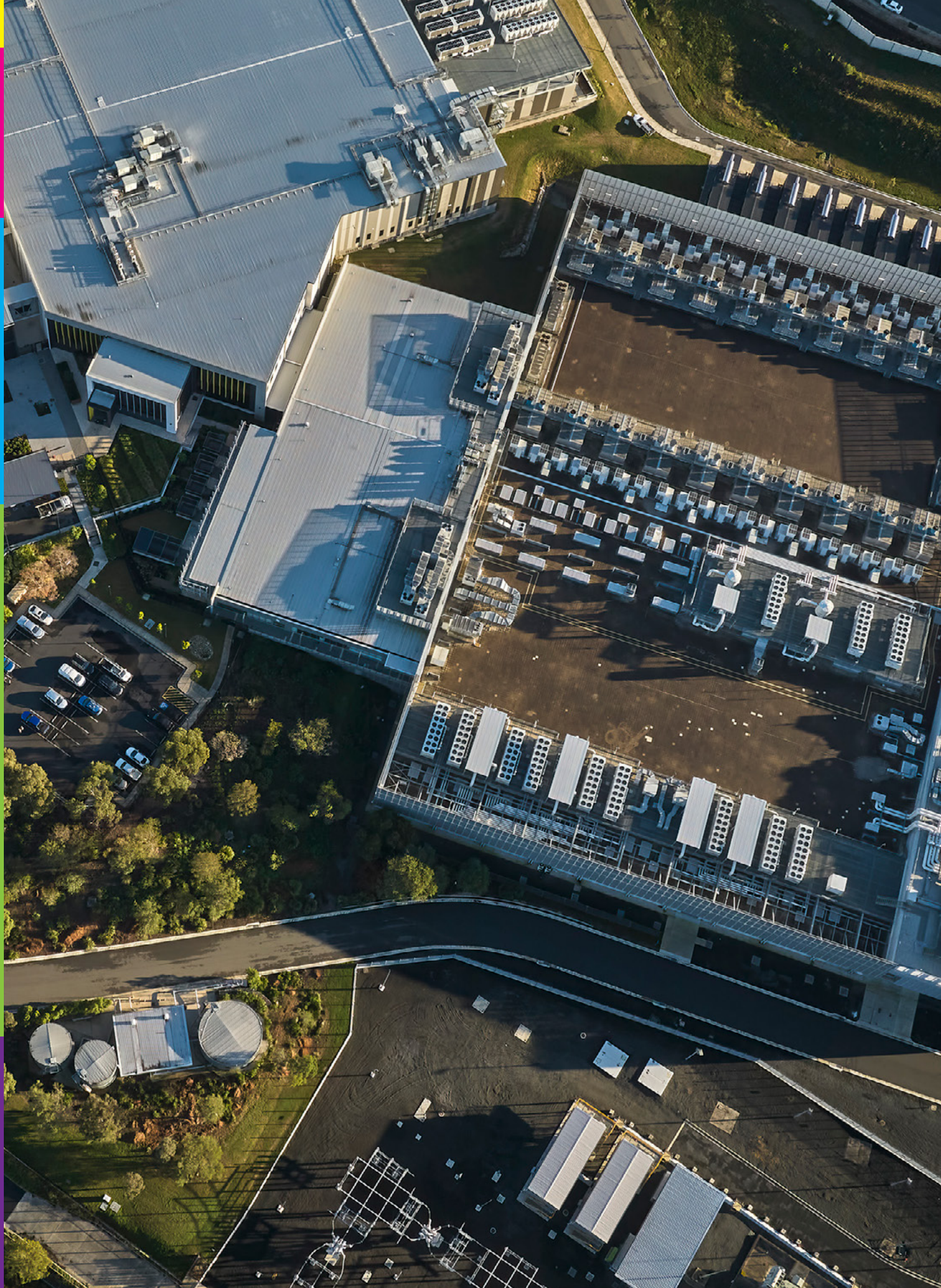
Eastern Creek data centre